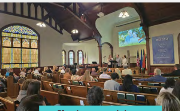
Sharing our ministry

During this time, we've had the privilege of visiting 26 churches across Michigan, Virginia, Pennsylvania, New York, Florida, Alabama, Texas, New Mexico, Arizona and California as well as spending time at Grace Christian University. At every stop, we've met faithful men and women who love and serve the Lord with all their hearts. Their passion and dedication have been a true encouragement and motivation to us.