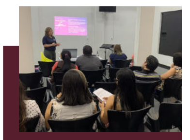
Marriage Course in Paraguay